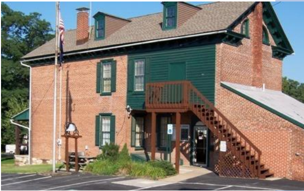
Leesport Borough Hall 27 S. Canal Street