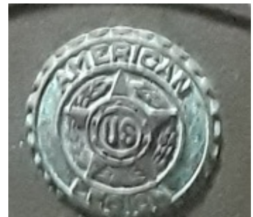
This issue mystery

In the last issue we had a photo of the corner of a hand held slate board that individual students would have had in earlier days. This is on display in our classroom at the museum. If you have a guess for this issue's mystery you can email your guess to leesporthistory@aol.com or you can stop by the museum whenever we are open and see the item.